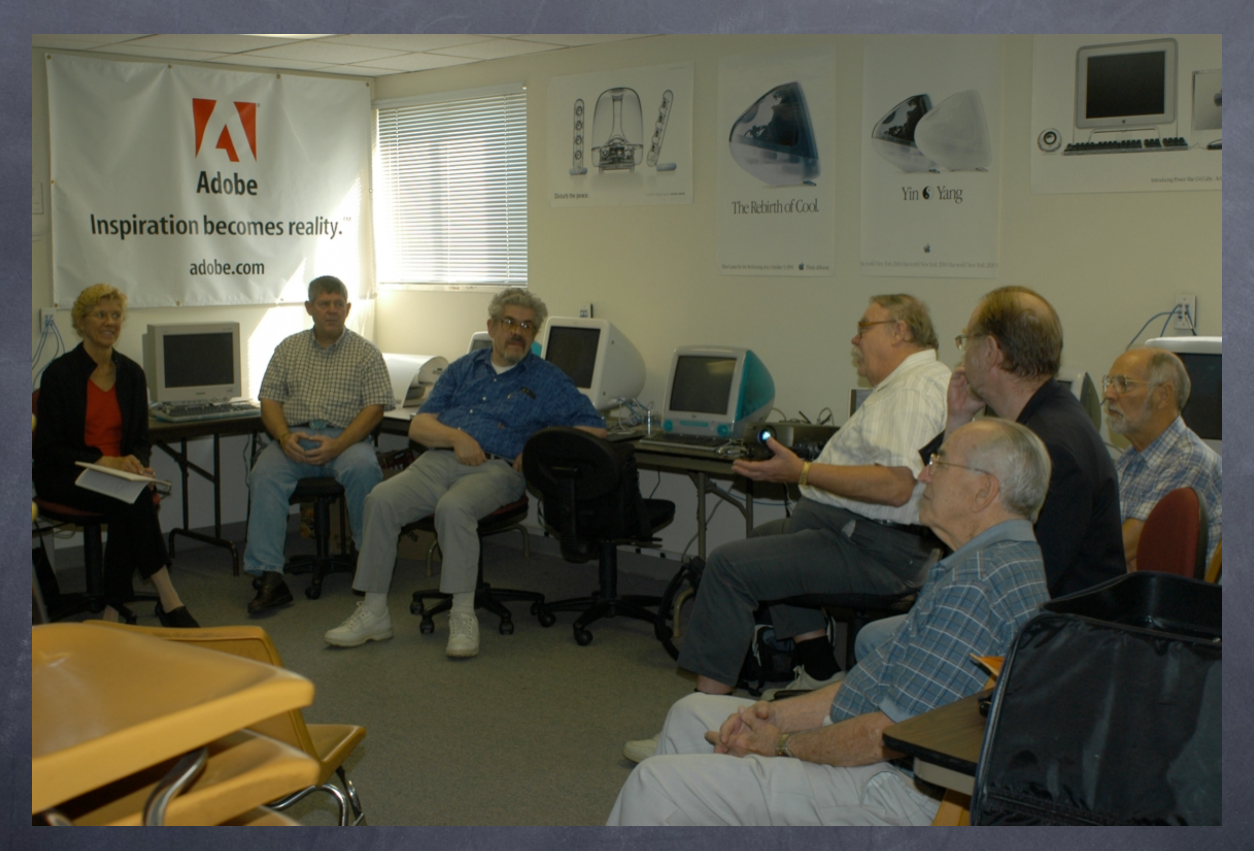
Y'All come join us next time