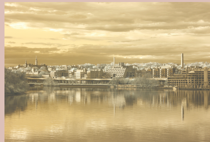
Best in Show Winner for the second Washington Apple Pi Photo Contest. The image of Georgetown on the banks of the Potomac River was taken using an infrared filter. Stunning photo!